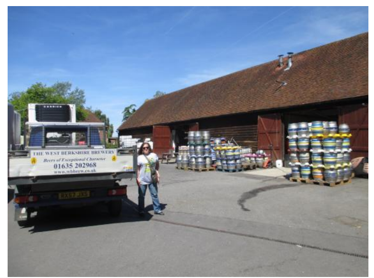
West Berkshire Brewery.

So, a very full and greatly enjoyable week came to a close. I am extremely indebted to my wife Felice for clocking up well over 1000 miles, often on roads that are not built for the traffic of today.