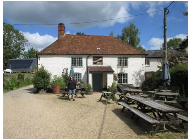
The Cricketer's Arms.

We stayed the night at Tangley, The Cricketer's Arms being a 16th century drovers' inn with cask beers on gravity dispense.