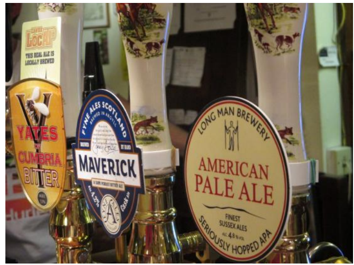
Manor Arms cask beer engines.