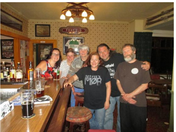
In the Prince of Wales.