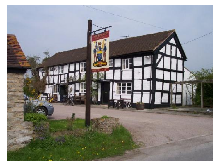
Farmers Arms, Birtsmore.

The Dent Brewery is not in the village, but over a couple of hills further on where the Settle and Carlisle Railway can be found. The Rambrau was an exceptionally good cask-conditioned lager, brewed with lager malts and Hallertau hops. Very clean and refreshing, it didn't take long for me to demolish three 20oz pints of it. The Baarister is a fairly uncommon find, being a tasty best bitter. T'Owd Tup, which translates from the local dialect into 'The Old Uncastrated Ram'(!), is a full-bodied stout with a roasty and vine fruit complexity.