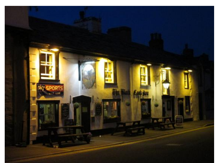
The Black Cock Inn at dusk.