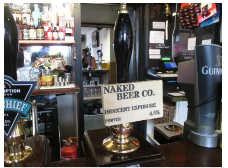
Naked in The Bear.