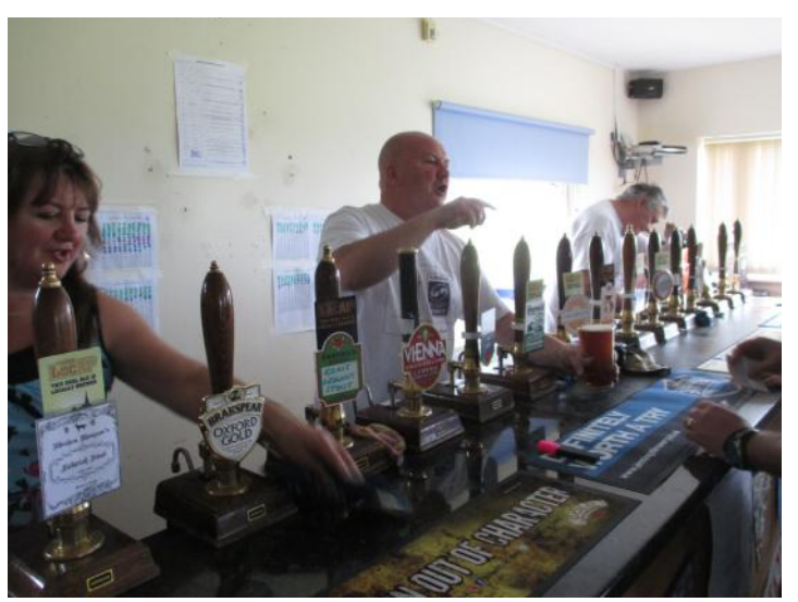
Rugby Club beer engines.