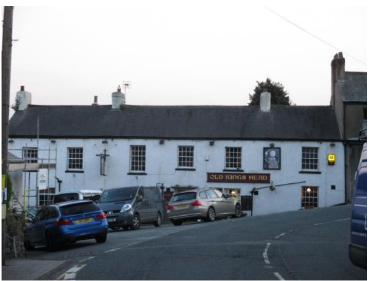
Old King's Head.

It is notable that the Long Man cask was brewed in a village near Brighton, our starting point, and had ventured a long way from home. The brewery is almost next door to the churchyard where my great-grandparents are buried.