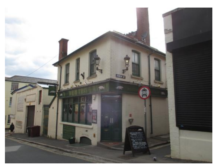
The Fat Pig brewpub.

The Fat Pig is a small backstreet brewpub, while the Well House has something a bit more than beer in the cellar - a skeleton said to be a plague victim!