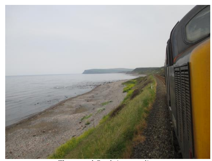
The rugged Cumbrian coastline.

Maryport was somewhere I had never been before, so we explored this sleepy fishing town until it was opening time. While the service at The Lifeboat Inn was friendly and prompt, a framed campaign poster for U.K.I.P. (a far right political party which wants to sever all ties with the European Union) hanging in the middle of the wall made it clear that we were unwittingly in somewhere that is a politically active base in not the best way. We then did a train to Millom, where we found another local beer to Brighton a long way from home - namely the Naked, who did several festival special ales for Glastonwick. The beer in this case was a very pleasant porter. A taxi to the Rugby Club's cask festival was then done, with arrangements made for the driver to return in about an hour's time to catch the next train. Some impressively unusual beers were on offer. I was very pleasantly surprised to find an Abraham Thompson beer, brewed infrequently on a nano half barrel plant, which was a great, chewy stout. We could have stayed longer as the train ended up being half an hour late. No problem though, Hardknott Brewery has a taproom on the station!