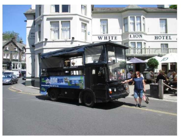
Milk float transformed into a bus!