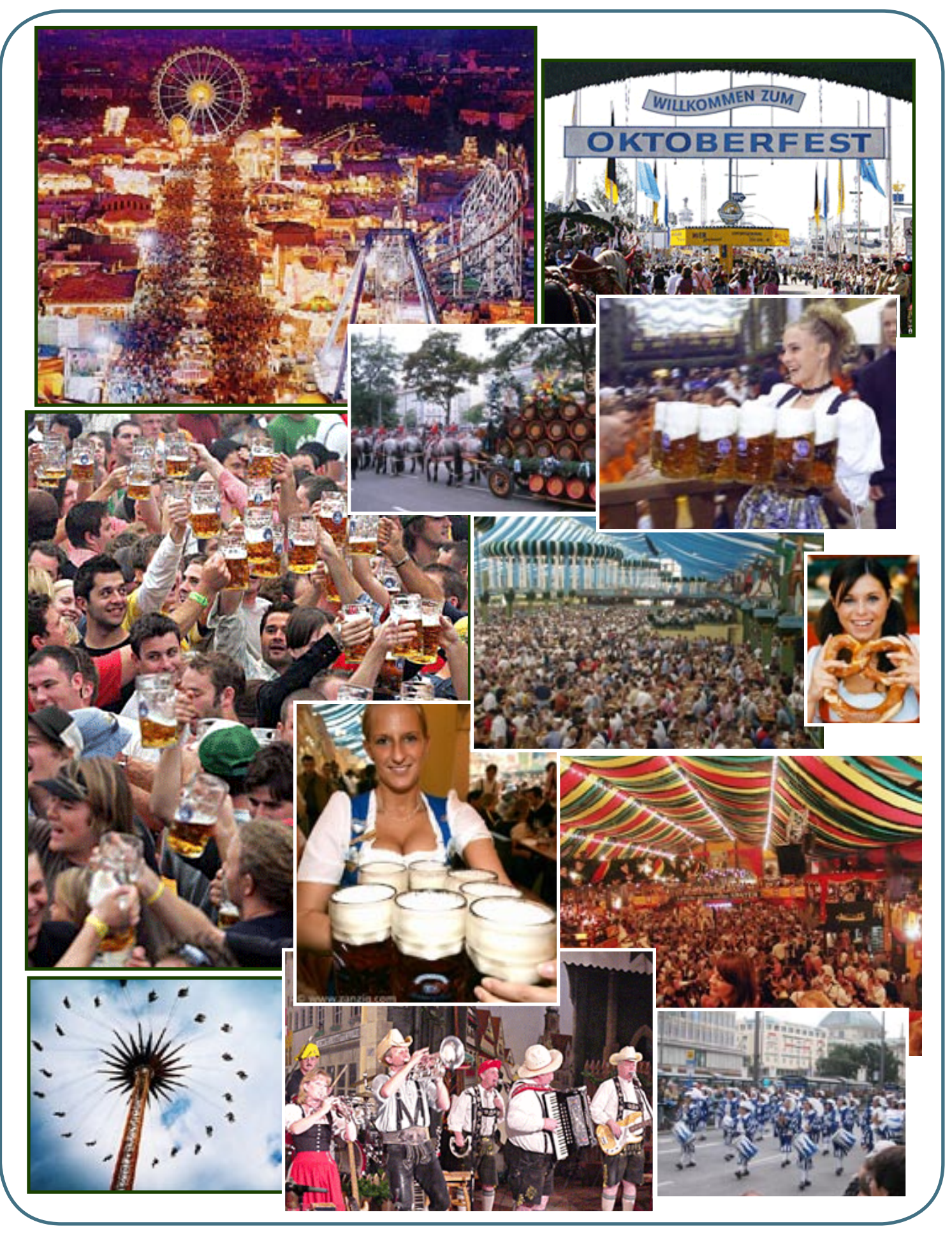
MALTED BARLEY APPRECIATION SOCIETY · SEPTEMBER 2008 · PAGE 5